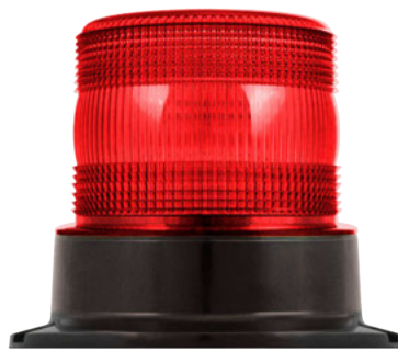
EQR65RBM R10 Red