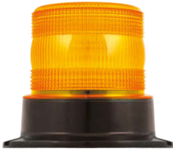
EQR65ABM R65 Amber