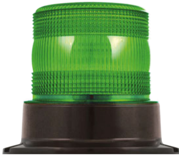
EQR65GBM R10 Green